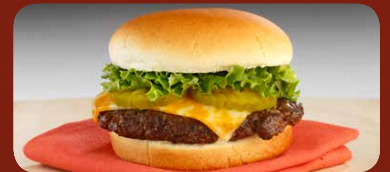
Crescent City Burger