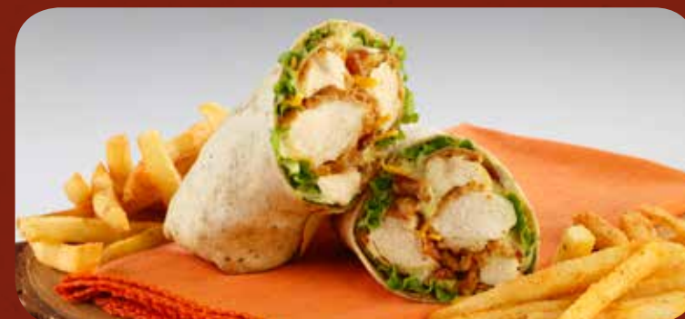
Pick Your Wrap